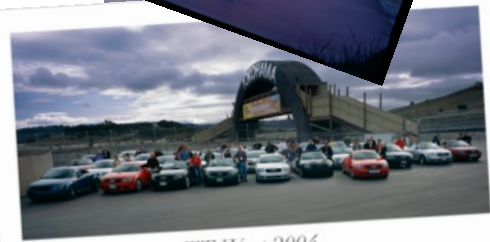
TT West 2004 Carmel • Monterey • Laguna Seca