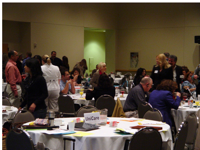
Participants take a short break and network