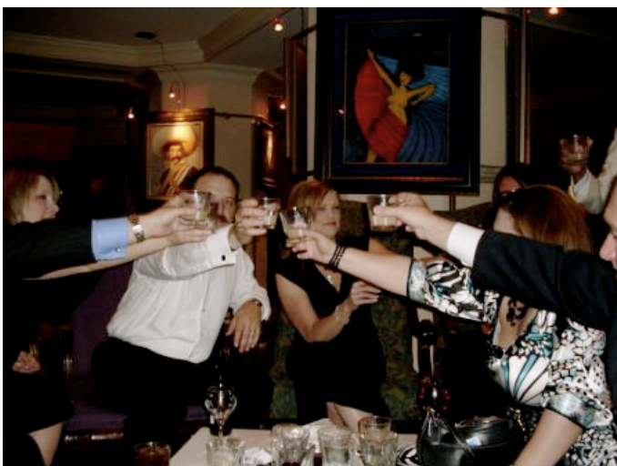
SAAHU representatives toast a successful year and our TAHU Awards.