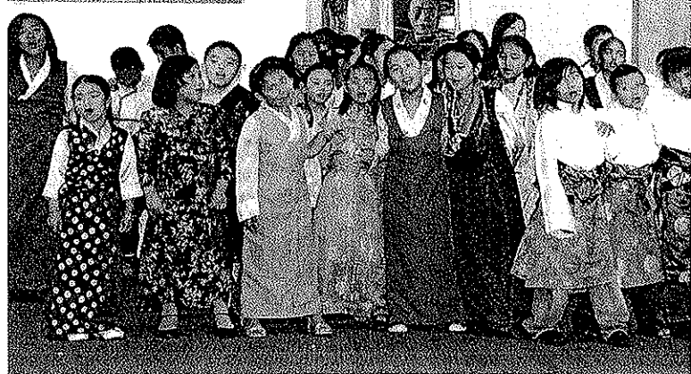
Tibetan Cultural School students singing, St. Paul, 2008

Early 1900s Ministry Cultural Center Raymond Avenue