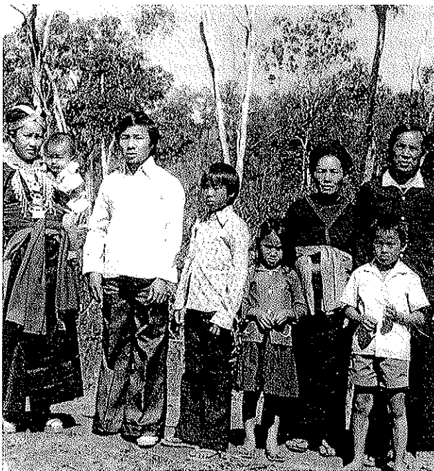
Yang family, Ban Vinai refugee camp, Thailand, about 1978

I must say that I have been very fortunate over here. I am now employed as teacher and precentor in a little village a few miles from here called Edvatter [Atwater]. In this village there are two Swedish and one Norwegian church. 8 days after writing my first letter to you I had this post offered to me by the Norwegian minister up there. . . . As a teacher and precentor I will, according to